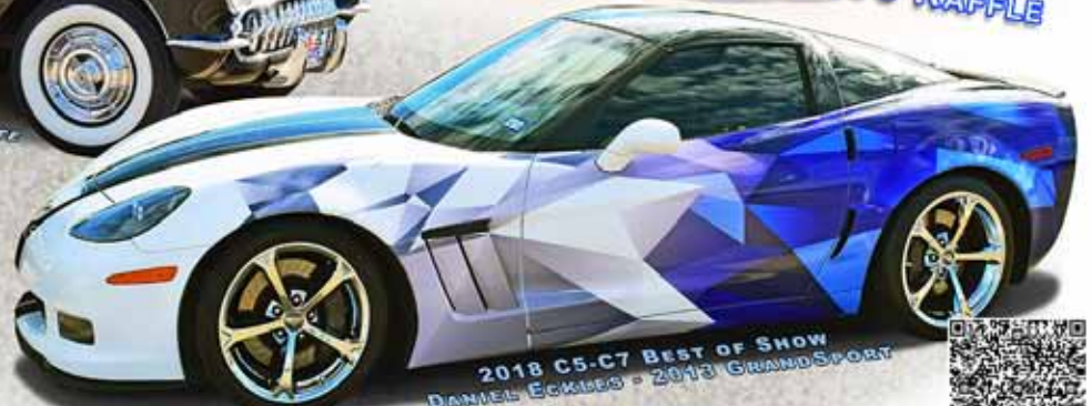
2018 C5-C7 BEST OF SHOW DANIEL ECKLES - 2013 GRANDSPORT