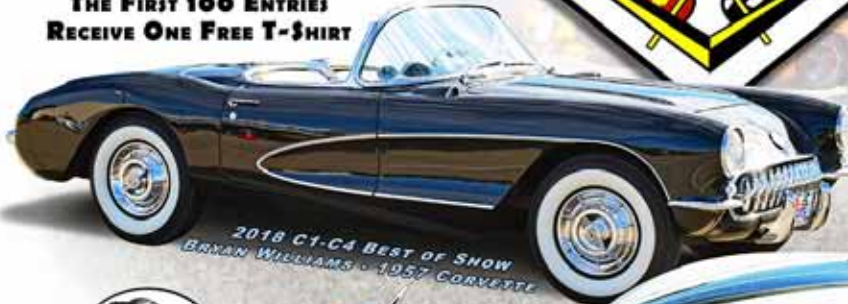
2018 C1-C4 BEST OF SHOW BRYAN WILLIAMS - 1957 CORVETTE

THE FIRST 100 ENTRIES RECEIVE ONE FREE T-SHIRT