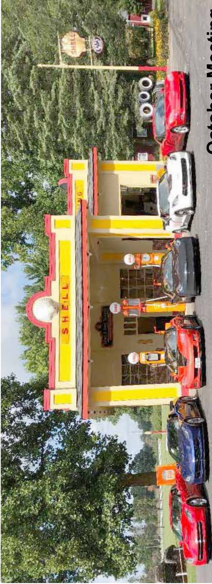
Legends/Cowtown 2019 Corvette Caravan group at The Gilmore Automotive Museum in Hickory Corners, Michigan