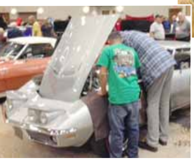
Lee Brumit's Blue '65 Coupe