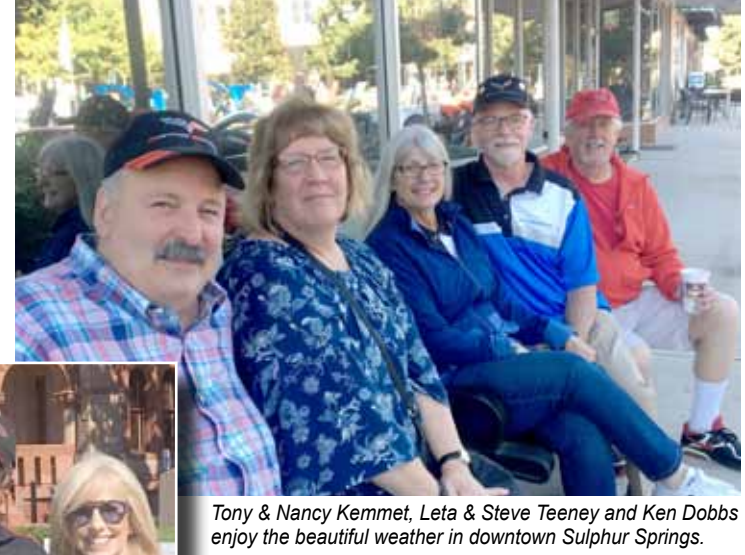
<Top 50 Al Lisbona