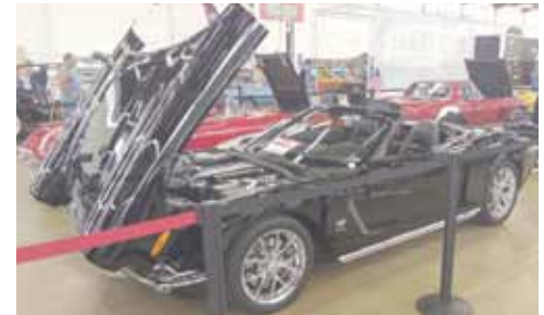
Kimberly Atchley's customized 2005 with 1962 Classic Reflection Coachworks body.