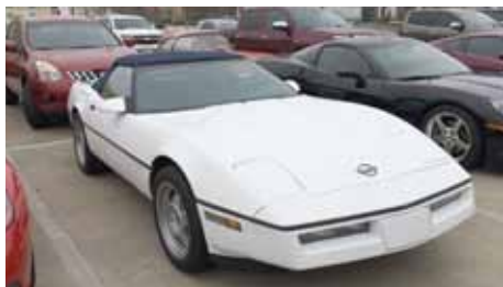
Mack Rogers' 1990 White Convertible