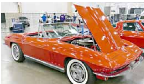
Walt & Sandra Plumley's 66 Red Roadster