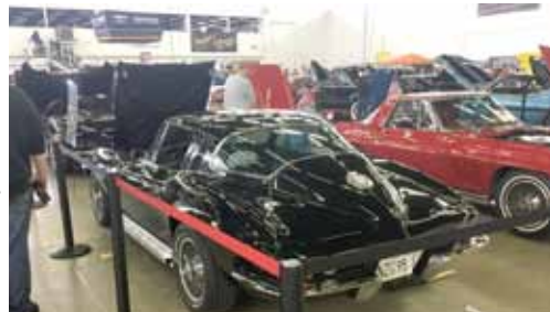
Jack Hays' Glen Green 1965 Coupe

We had a Patriot Paws table prominently at the corner of our display. We collected $969 to be given to them. Thanks to all our Legends members who helped staff the display to promote our club and Patriot Paws.