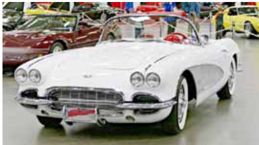
New members Matt & Darlene Tidwell's White 61 NEW CAR-Continued from page 10