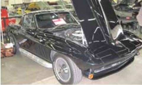
Rude Dog Hays' 1965 Glen Green Coupe