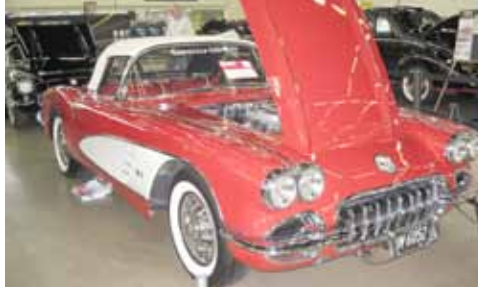
Al Macdonald's Red/White 1960 Roadster