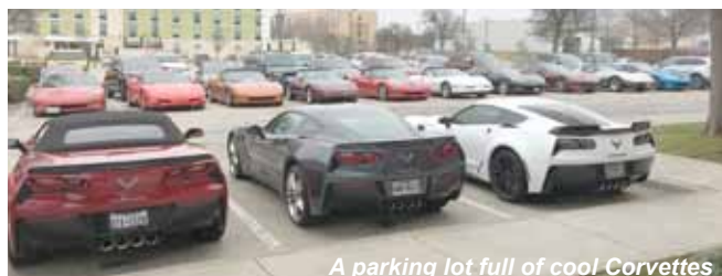
A parking lot full of cool Corvettes