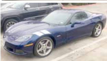
Visitor, Gary Stroble's Blue C6 Grand Sport