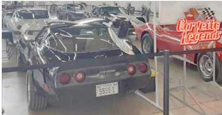
Joe Koester's Black 1982 Coupe