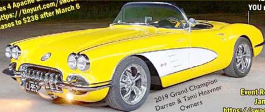
2019 Grand Champion Darren & Tami Heavner Owners

2019 participants helped the SWOCC provide $9,000 to local charities in 2019! The Lawton Food Bank & Lawton/Ft Sill Boys & Girls Club receive the majority of our fundraising dollars. YOU make the difference!