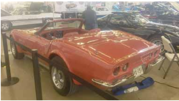
Kevin Shedden's 1971 Red Convertible