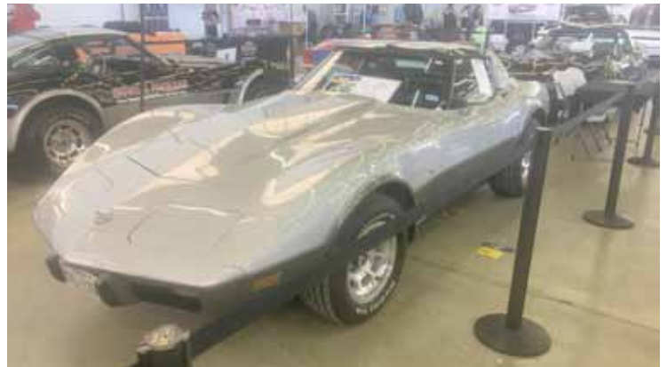
Len Woodruff's 1978 Silver Anniversary Coupe