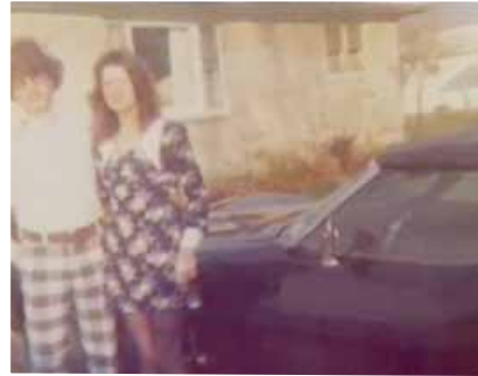
CAMBY, Ind. March 29, 2019