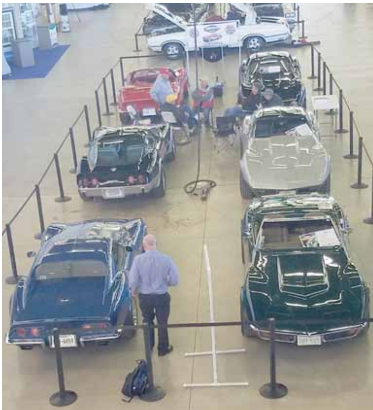
A bird's-eye view of the Legends' display before the show opened