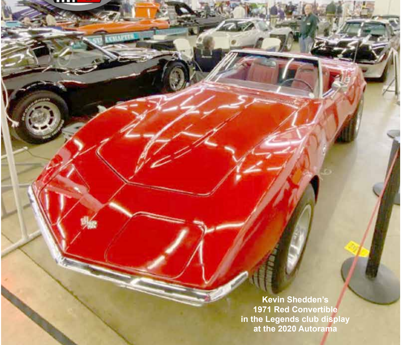
Kevin Shedden's 1971 Red Convertible in the Legends club display at the 2020 Autorama