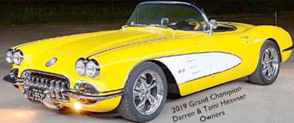
2019 Grand Champion Darren & Tami Heavner Owners