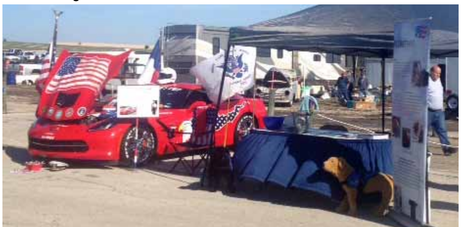
Jim Brummett's 2017 Red Patriotic-Themed Coupe on display at the Patriot Paws booth.