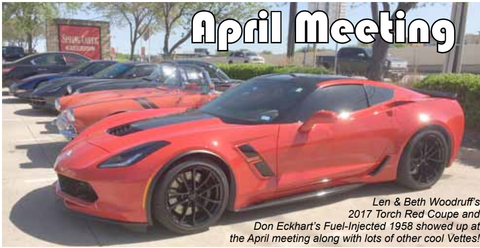
Len & Beth Woodruff's 2017 Torch Red Coupe and Don Eckhart's Fuel-Injected 1958 showed up at the April meeting along with lots of other cool Vettes!