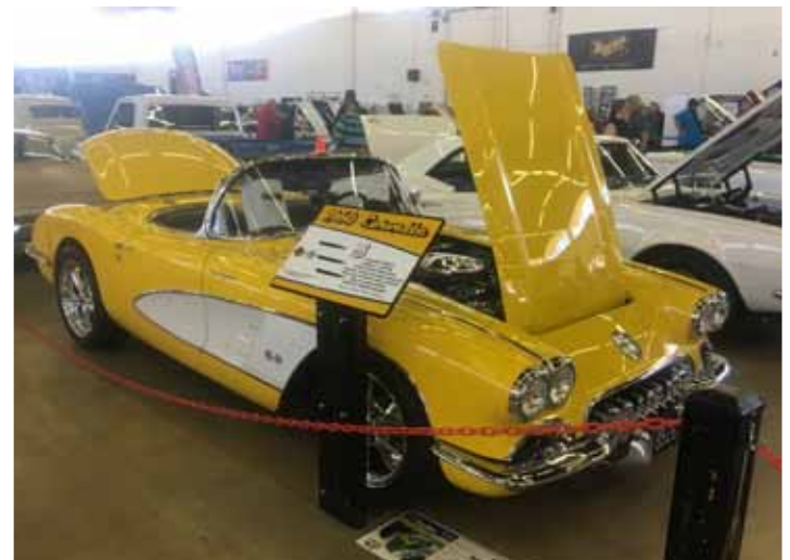
Darren & Tami Heavner's Velocity Yellow/White 1960 from Ft. Worth. 350/325 FiTech Fuel Injection, Tremec 5-speed, Wilwood 4-wheel disc brakes, Martz suspension, built by Triple F Automotive, Ft. Worth, TX