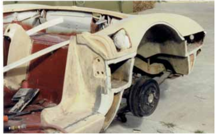
The rear wheel openings had been flared and we put on new panels to restore the original body lines.