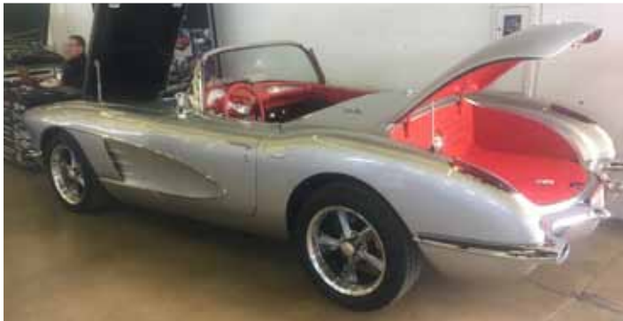
1960 Silver with Red interior built and shown by Carr's Corvettes.