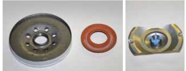
K&N makes use of a drainback valve made from a silicone material. Get another look in the next photo.