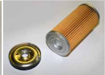
The Wix race filter does not include an anti-drainback valve in the assembly, nor does it make use of a bypass valve.