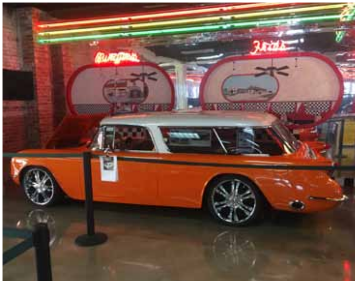
One-of-a-kind 1955 station wagon styled with a 53-55 Corvette body similar to the Waldorf Nomad concept shown at the 1954 General Motors Motorama in New York City.