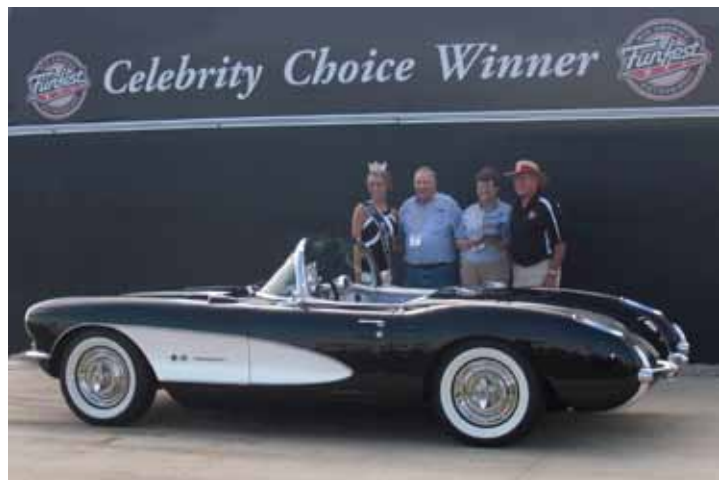
Drove to Funfest at Mid-America Corvettes in Effingham, Illinois