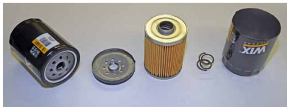
Here's the Wix replacement (conventional Chevy) filter stripped down. The center post incorporates drilled holes.