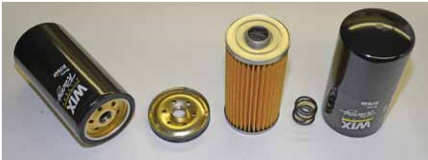
Here's the long Wix race filter broken down into separate pieces. It incorporates a drilled center post.