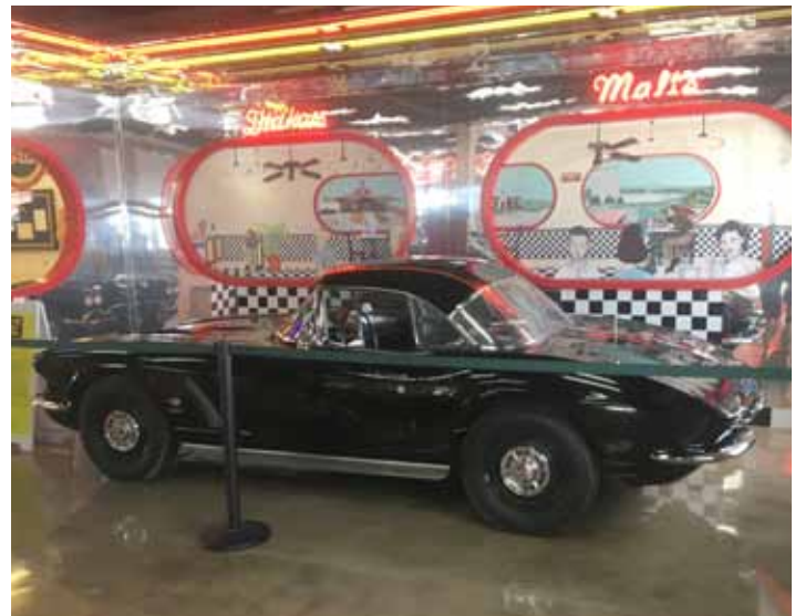
Black on Black 1962 Fuel-Injected Corvette