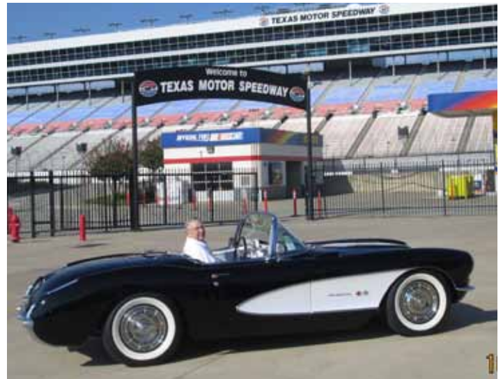
Home-Built Heaven Winner at 2015 Good-Guys Lone Star Nationals, Fort Worth