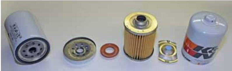
This is the K&N filter stripped down to the basics, where you can see the filter's lowered center post.