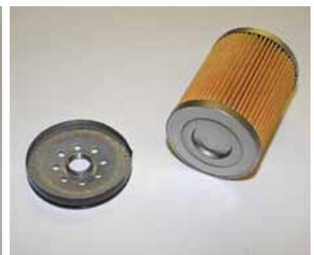
The Wix replacement filter doesn't have a bypass valve or an anti-drainback device.