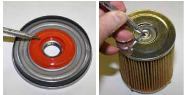
Here's the anti-drainback valve incorporated in the Summit Racing oil filter located beneath the baseplate or "Tapping Plate." This ensures oil remains in the filter following engine shutdown.