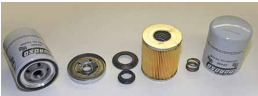
This is the Moroso race filter broken down. It incorporates a lowered center post assembly.