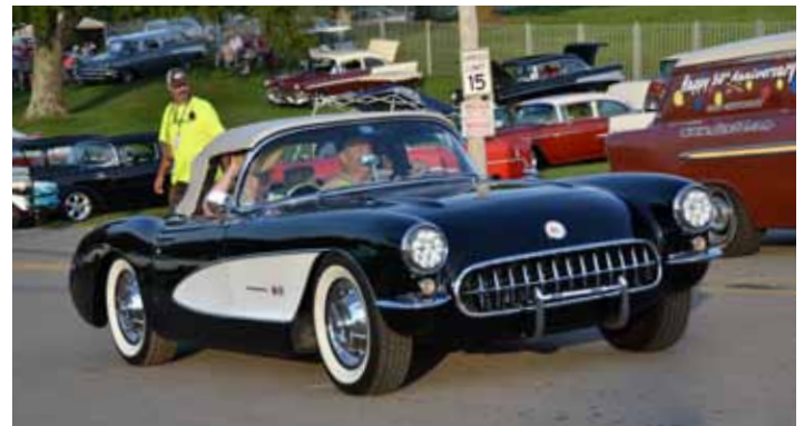
Drove to the Tri-Five Nationals in Bowling Green, Kentucky