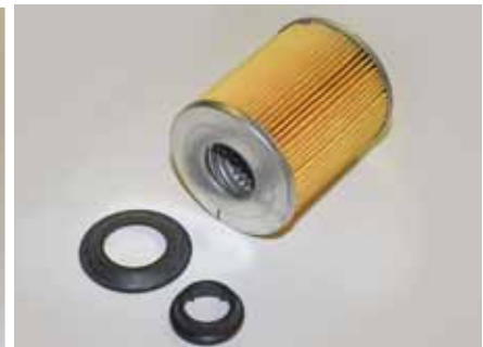
The Moroso race filter does not incorporate a by-pass valve, however the anti-drainback arrangement consists of two pieces. The smaller piece locates the valve within the element