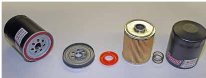
Here's the Summit Racing filter both complete and stripped down to the bare elements. The Summit Racing filter makes use of a center post with drilled holes. Check out the next photo to see what we mean.