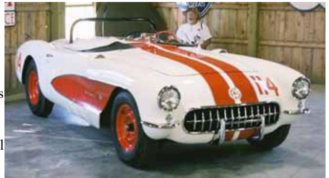
This car was the first 1957 to be equipped with racing brakes and suspension. It was runner-up to the national champion in the B Production class of the Sports Car Club of America.