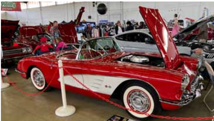
White/Red 1960 owned by Gordon Koterba, Paradise, TX