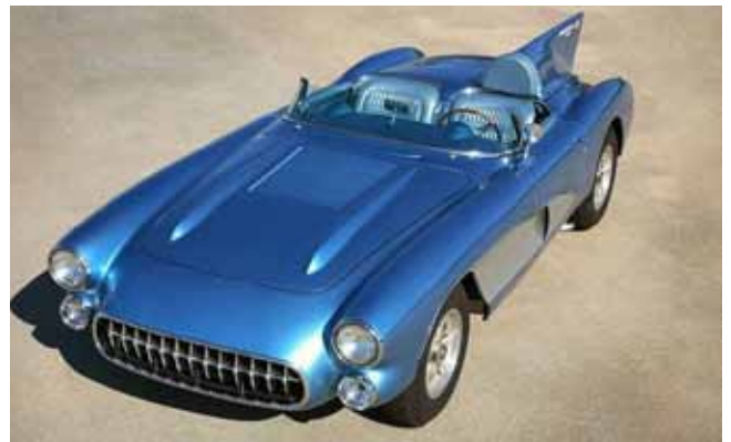
This 1956 SR-2 is unusual because it has an extended nose, headrest with fin and louvers in the hood.