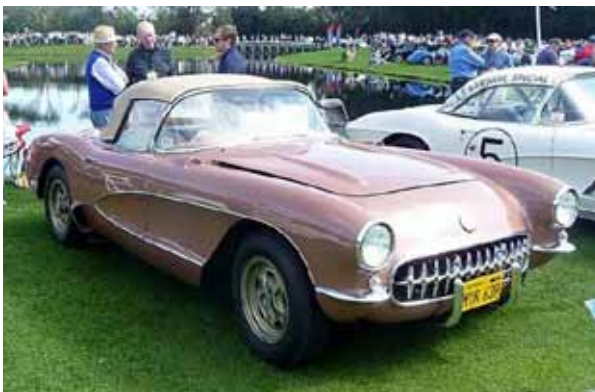
This is one of two existing 1956 SR-1 Corvettes. It was built with racing components to satisfy production requirements for the 12 Hours of Sebring.