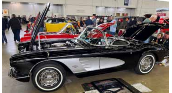
Black/Silver 1961 owned by Gordon Moore, Dallas, TX