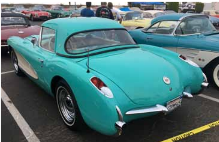
An interesting after-market C-1 hard top.

Our hotel was right on the Ventura Marina, so what better than to take a cruise. Island Packers Cruises furnished two double decker boats and very tasty dinner of ribs, all the fixins and creme brule for desert. We actually just cruised around the marina as the wind was very strong and I think that they thought we'd throw up dinner, if we went out on the open sea.