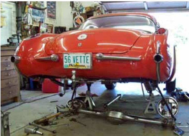
PARSONS--Continued from page 4

unit, built my own heavy duty brakes (with self adjusters), upgraded the suspension and steering to what 60-62 Vettes have, replaced the front wheel ball bearings with roller bearings and have stock GM painted steel wheels (15x6 front and 15x7 rear) with 56 dog dish caps. Cruise control has also been added for road trips. The intent was to simulate a 57 Airbox car.