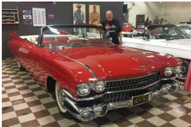
A walk down memory lane at the Murphy Museum in Oxnard looking at a red 1959 Cadillac convertible like we bought in 1962.

Driving back across the western LA area Thursday afternoon, we checked into the SACC Convention hotel in Ventura and started visiting with all the members and looking at all the Solid Axle Corvettes that had arrived. We took in one last car museum in Oxnard Friday morning, the Murphy Auto Museum. It had an average selection of old and mid-century cars and a special display of "car campers" from the 40's & 50's.