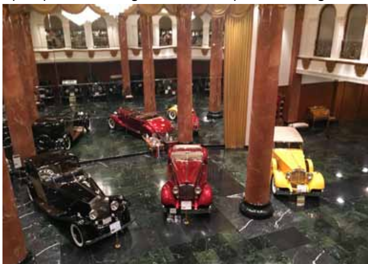
The posh recreation of the 1930s showroom at the Nethercutt Collection

Then Thursday morning we were up in Sylmar to see the high-quality car collection at the Nethercutt Museum. We had made reservations for a guided tour of the Nethercutt "Collection" that afternoon, that is housed across the street from the Museum. There were interesting cars in the basement, the first floor was an amazing re-creation of a 1920s Luxury Car Showroom with several equally amazing cars. The second floor mezzanine had some wonderful collections of watches, music boxes and more. But the third floor was incredible. There were many large old automatic-playing Orchestrians and a Theater Pipe Organ all run by pumped air. Our guide was the person charged