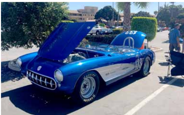
Cloyd Gray's factory FI '57 raced in '58. Now owned by Miller Uwanawich