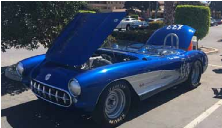
Race car driven by Orwin Middleton