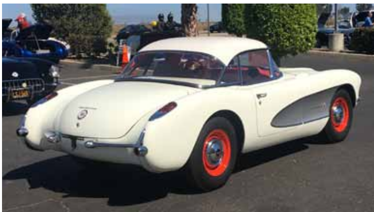
Racer VIN #4255 now owned by Kent Browning