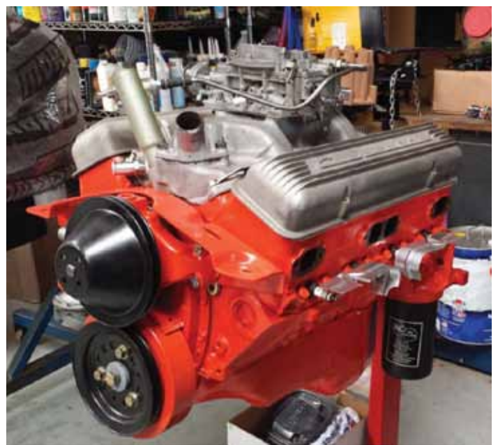
Painted Engine with Correct Canister Oil Filter.