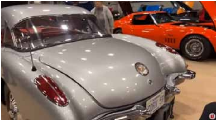
Casey Coats' 1959 Silver/White from Derby, Kansas -- C1 Class