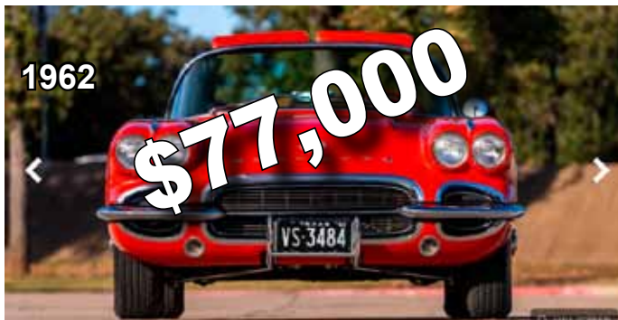
1962 $77,000 327 CI V-8 engine. 4-speed trans. Roman Red exterior. White convertible top. Matching Red interior