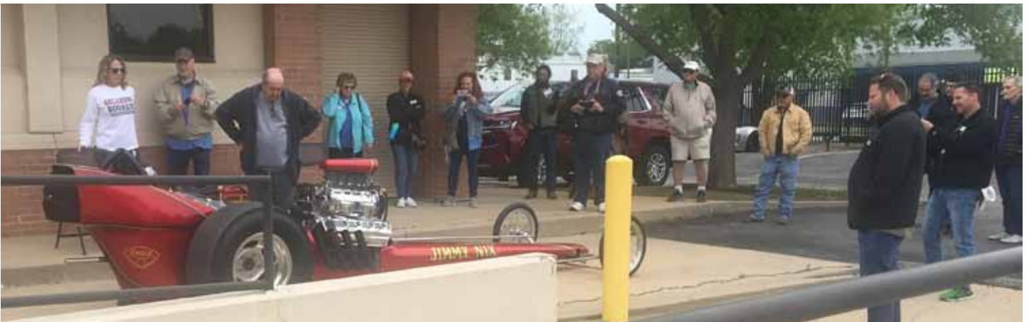
The race team moved this dragster outside to start it for us, so we could enjoy its sound... after they passed out the ear plugs.