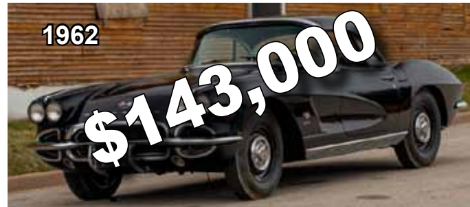
1962 $143,000 First year for the 327/360 HP Rochester fuel-injected V-8 engine. High lift camshaft. 4-speed manual trans. Tuxedo Black with matching hardtop. Black interior. Black soft top. Bright rocker panel trim.