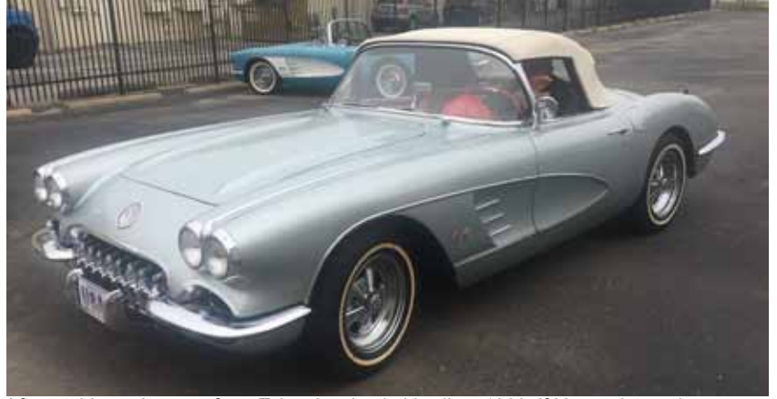
I forgot this guy's name from Tulsa, leaving in his silver 1960. If it's you let me know.