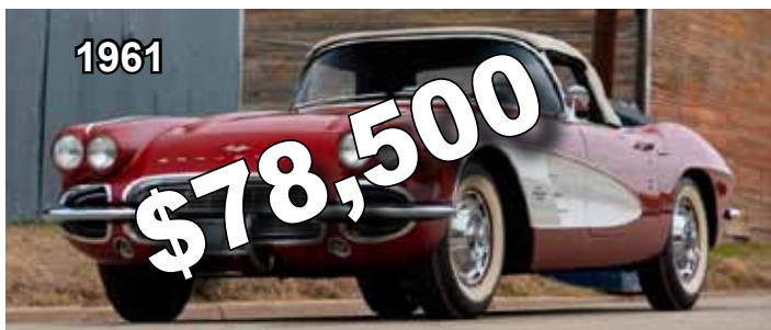
1961 $78,500 283/315 HP Rochester fuel-injected V-8 engine. 4-speed manual transmission. Honduras Maroon with White covers. Black soft top. Black interior