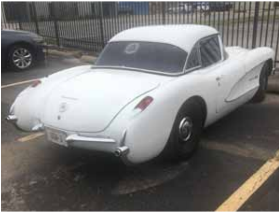
Verl Randolph's White 1957 from Owasso, OK