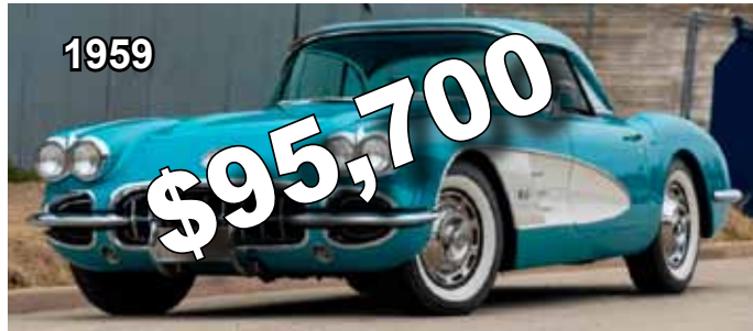
1959 $95,700 Crown Sapphire with White covers. Color-keyed removable hardtop. Blue interior with padded dashboard. 283 CI V-8 engine. 4-barrel carburetor. Finned aluminum valve covers. Automatic transmission. Wonderbar radio.