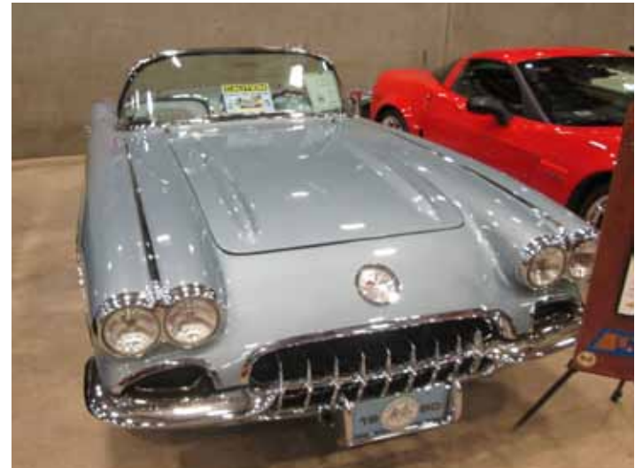
Curtis Crain's Horizon Blue 1960 from Wichita, KS -- C1 Class