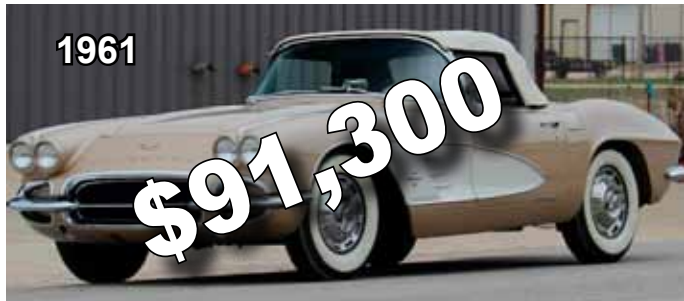
1961 $91,300 Fawn Beige with White covers. Fawn interior. Beige soft top. 283/230 HP V-8 engine with a 4-barrel carburetor. 4-speed manual trans. First year the 4 round tail lights were incorporated.