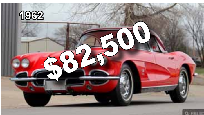
1962 $82,500 First year for the 327 CI Rochester fuel-injected V-8 engine. High lift camshaft 4-speed manual trans. Roman Red with matching hardtop. Red interior. Black soft top. Bright rocker panel trim.