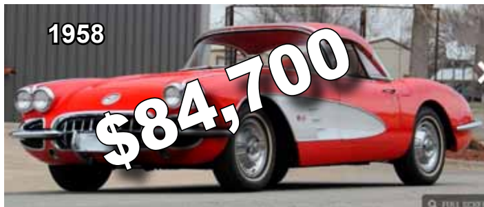
1958 $84,700 Signet Red with White covers. Red interior. Color-keyed removable hardtop 283 CI V-8 engine. Carter 4-barrel carburetor. Aluminum intake. Finned aluminum valve covers. 4-speed manual transmission.