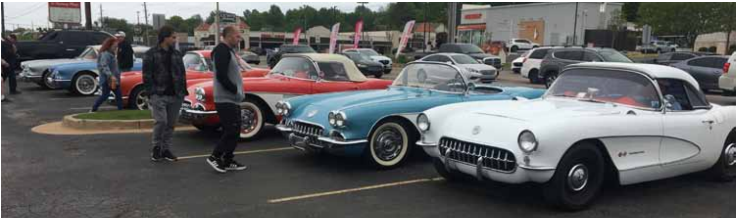
The Schlotzky's parking lot full of Solid Axle Corvettes drew a lot of attention at 71st & S. Lewis in Tulsa, OK where we met for lunch.