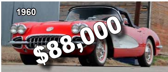
1960 $88,000 1 of 859 Corvettes produced with fuel injection for 1960. 283 CI V-8 engine. Rochester fuel injection unit. Finned Corvette script valve covers. 4-speed manual trans. Roman Red with White covers and a Black soft top. Black interior.