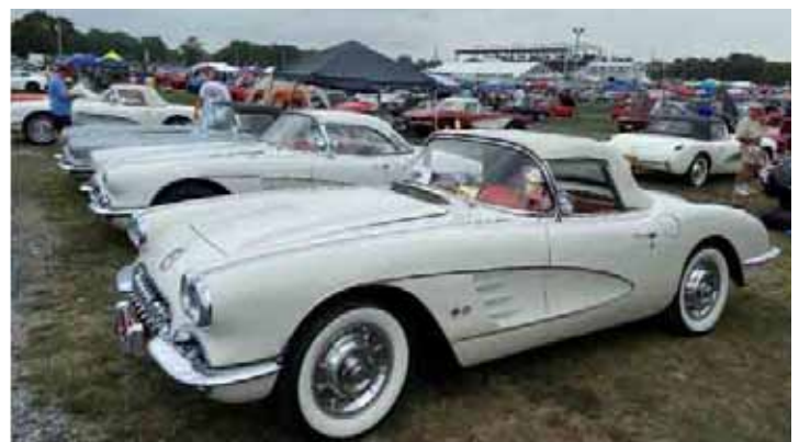
As soon as you enter the fairgrounds through Gate 3, you see the Solid Axle Corvette Club area--with a lot of C1's. The tent would normally be filled with SACC members selling clothing and memberships.