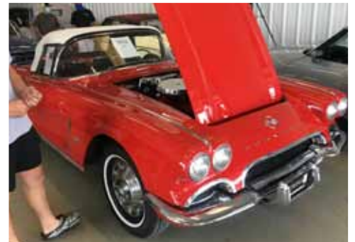
Red 1962 on display at Triple F