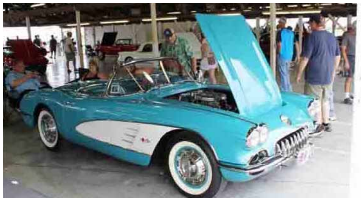
The Corvette Corral of "For Sale" cars had a number of really beautiful cars, but not as many as previous years. Here was a beautifully restored 1960.