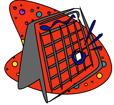
*CLoT Club Participation Event

*Feb 9 Legends Club Meeting Outback Steak House, Plano