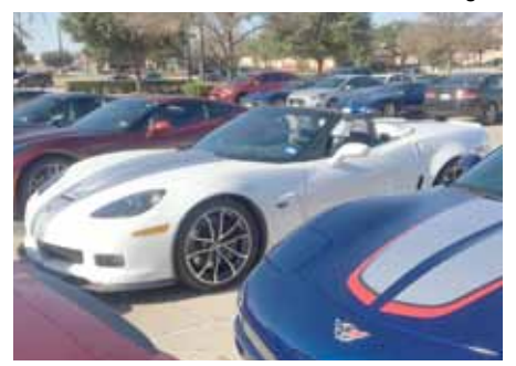
A rare Vette sighting... Don Eckhart & Denise Iverson's '13 White Calloway. It's been held hostage by Classic Chevrolet for months...