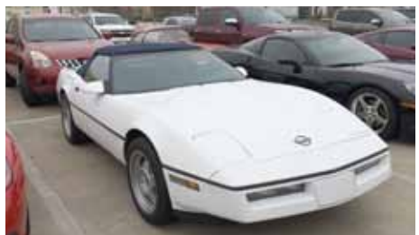
Mack Rogers' 1990 White Convertible