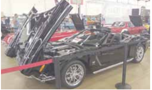
Kimberly Atchley's customized 2005 with 1962 Classic Reflection Coachworks body.