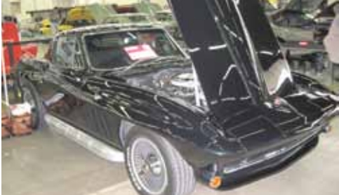
Rude Dog Hays' 1965 Glen Green Coupe