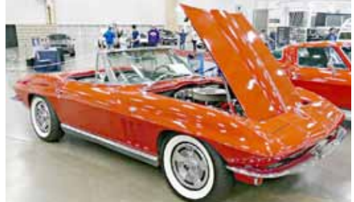
Walt & Sandra Plumley's 66 Red Roadster