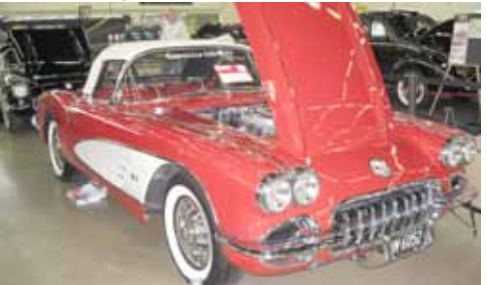
Al Macdonald's Red/White 1960 Roadster