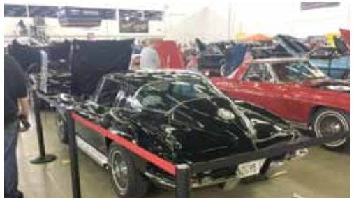
Jack Hays' Glen Green 1965 Coupe