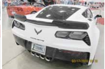
Lucky & Elaine Sluder's 17 White Coupe