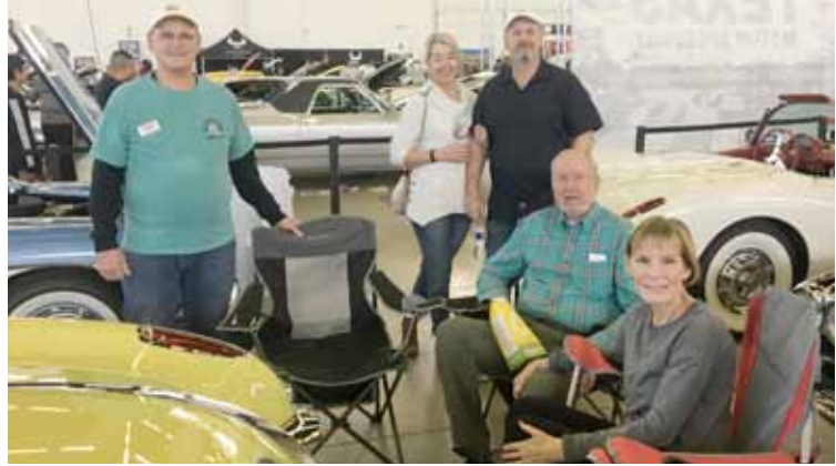
Tidwells' White/Silver 1961