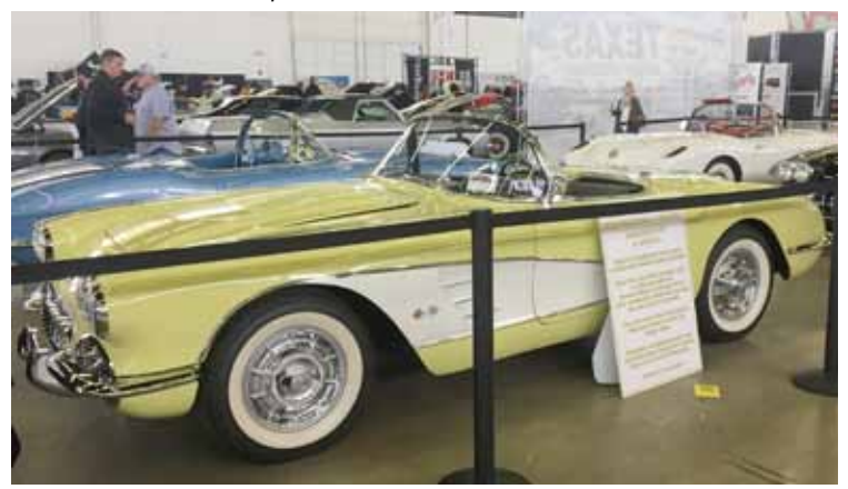
Brumits' Yellow/White 1958