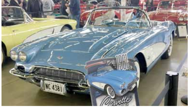
Dennis Conte's Jewel Blue/White 1961