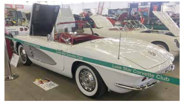
Tidwells' White/Silver 1961