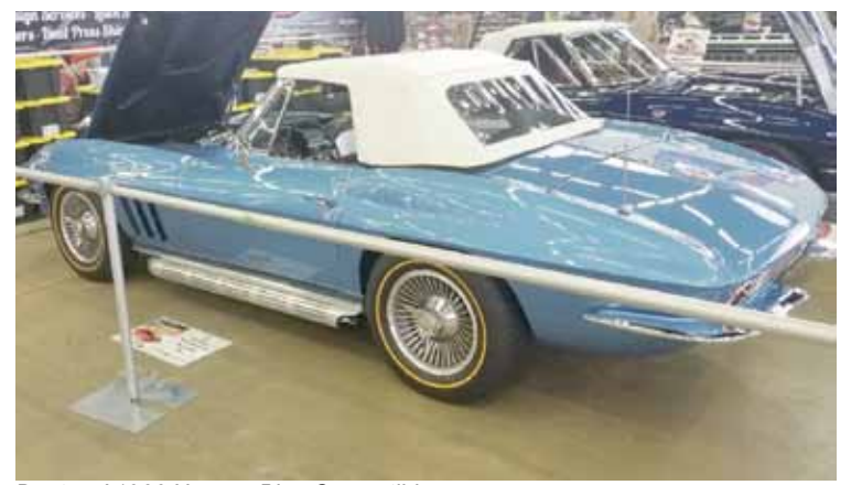
Deatons' 1966 Nassau Blue Convertible