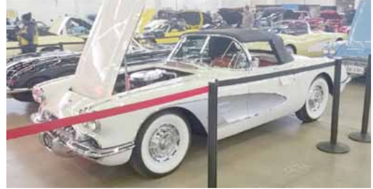
Maulsbys' White/Silver 1960