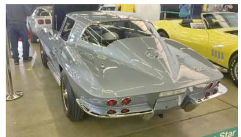
Brumits' Silver 1967 Coupe