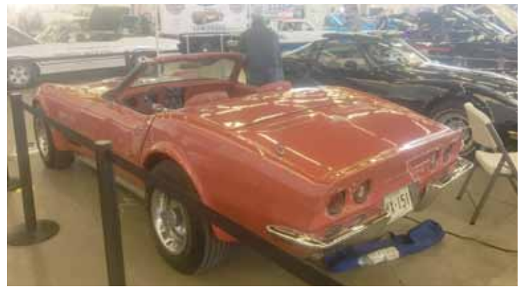
Kevin Shedden's 1971 Red Convertible