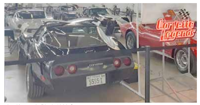
Joe Koester's Black 1982 Coupe