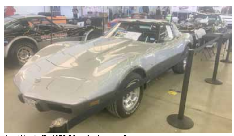
Len Woodruff's 1978 Silver Anniversary Coupe