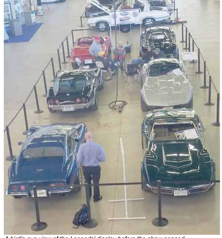
A bird's-eye view of the Legends' display before the show opened