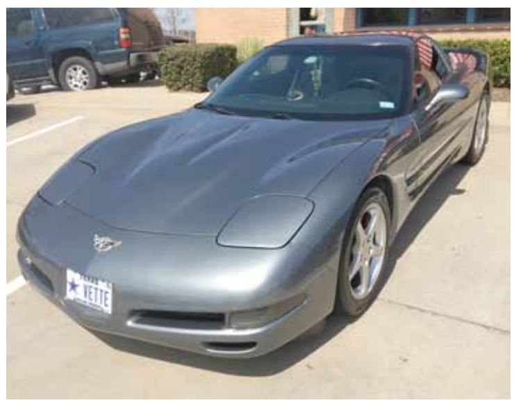
Herb LaPlant's Blue 2003 Coupe

Ken Dobbs reported that the Weekend Wrench group that is working on Tom Entrekin's car is now starting to