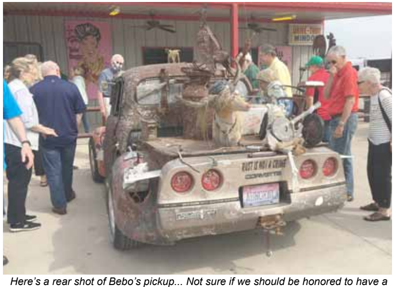
Vette part included or not. It's the only part that's not rusty.