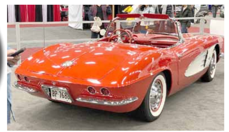
Tom & Sandy Lainson's Top 20 Red/White 1961