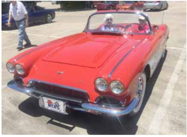
Sandy & Tom Lainson celebrate the beautirul day in their Red/White 1961