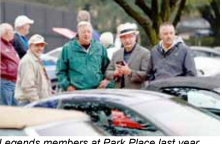
Legends members at Park Place last year.

Car Club move in is Saturday. September 28, 2019 at 8:30 AM (more information to be provided). NO automobile will be permitted to enter the premises after 9:30 AM.