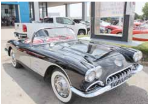
Rocky & Chris Rainbolt's Black/Silver 1959