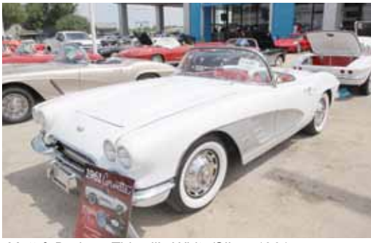
Matt & Darlene Tidwell's White/Silver 1961