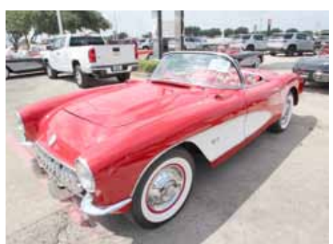
Nick Bernier's Red/White 1957