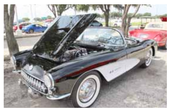
Bill & Diane Preston's Black/White 1957