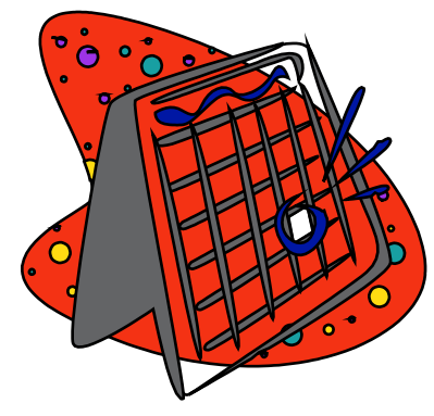
*CLoT Club Participation Event

Double check all event dates to make sure they haven't been cancelled or rescheduled.