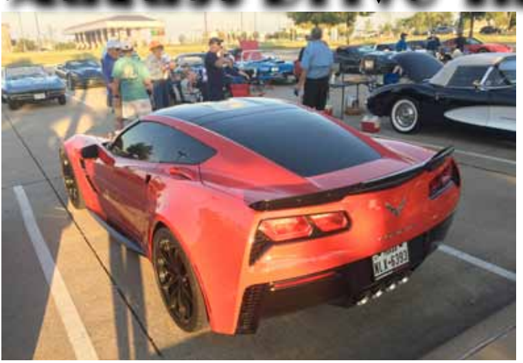
Len & Beth Woodruff's 2017 Red GS Coupe