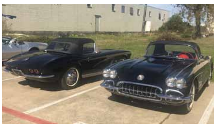
Nate Lanford's Black 62 and Rocky Rainbolt's Black/Silver 59