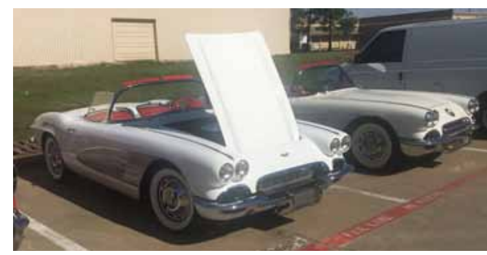
Matt Tidwell's White/Silver 61 and Maulsby's White/Silver 60