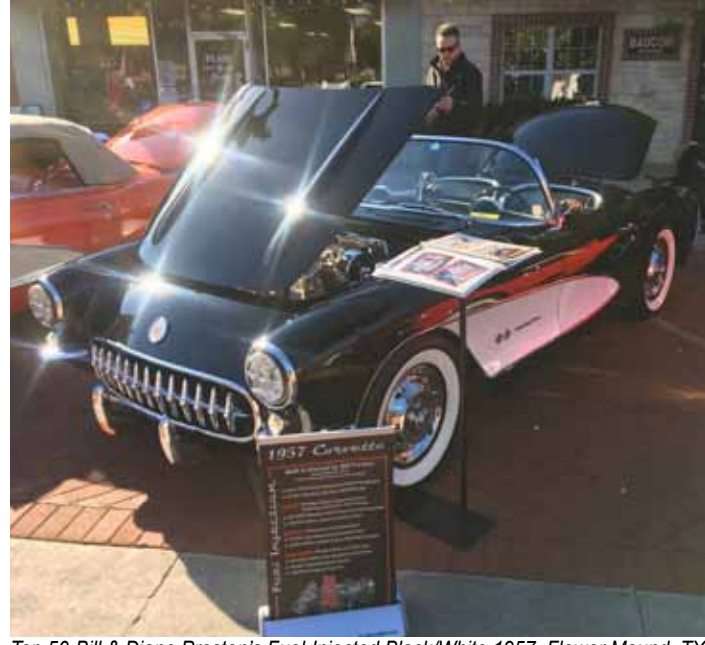
Top 50-Bill & Diane Preston's Fuel-Injected Black/White 1957, Flower Mound, TX