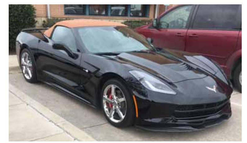
Jeff Clevenger's beautiful Black 2014 Convertible.