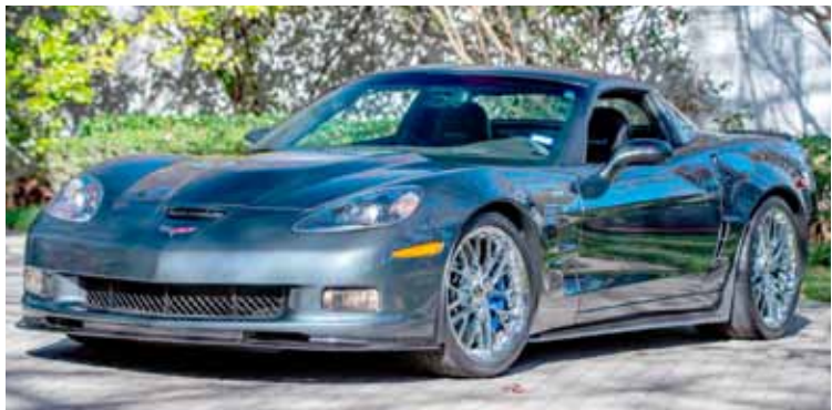
2009 Cyber Gray ZR1 Coupe LOT R112 – 6.2L/638 HP, 6-Speed, 2,925 Mi.