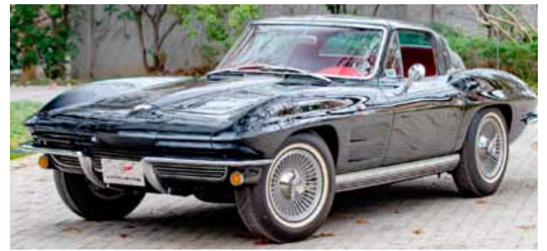
1964 Tuxedo Black Coupe LOT R107 – Fuel-Injected 327/375 HP, Top Flight