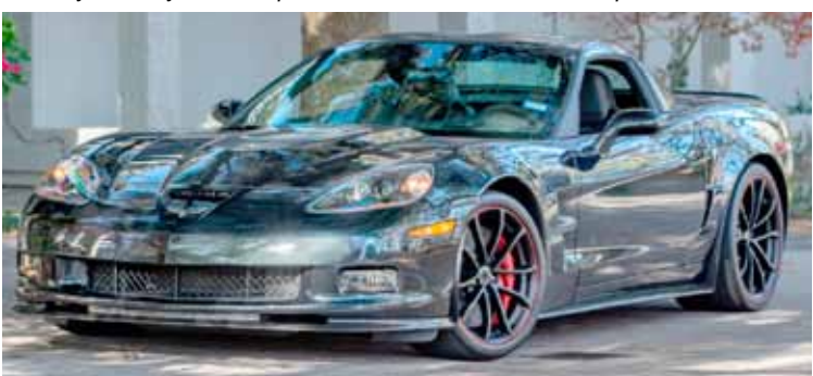
2012 Carbon Flash ZR1 Centennial Edition LOT R113 - 1,494 Mi, Serial #100