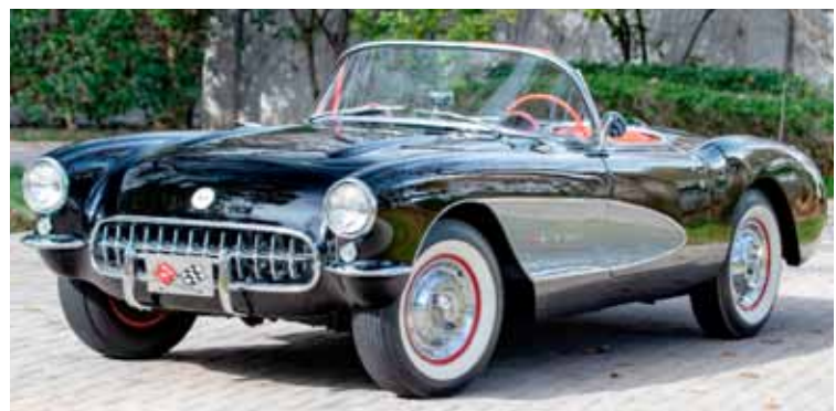
1957 Black/Silver LOT R104 - Fuel-Injected 283/283 HP, 4-Speed