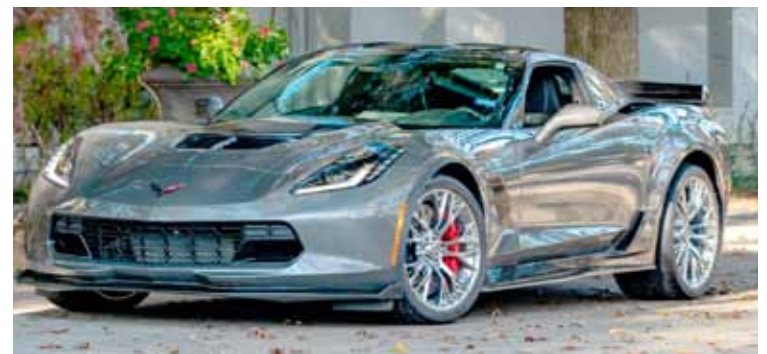
2015 Shark Gray Corvette Z06 Coupe LOT R114 – 6.2L/650 HP, 7-Speed, 1,009 Mi.