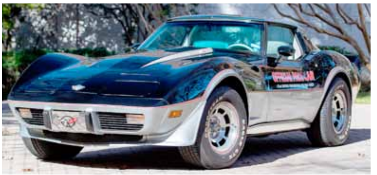
1978 Black/Silver Indy 500 Pace Car Edition LOT R110 – 350/220 HP, 4-Speed