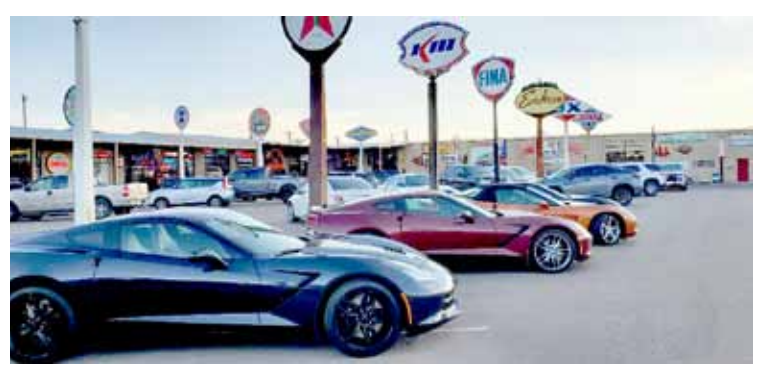
CANYON--Continued on page 10

We all really enjoyed going to dinner at Cook's Garage. They have a venue for rock and country concerts every few weeks, regular live music, a big car show twice a year, a monthly cars and coffee, an auto restoration shop, a neon sign shop, and an extensive collection of