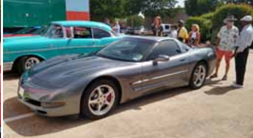
Ken Dobbs' 1957 Turquoise Chevy Hard Top and Herb DuPlant's 2003 Spiral Gray Coupe