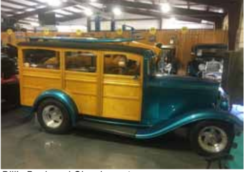
Bill's Backyard Classics auto museum.

We were on our own to visit the various museums and sites in the area during the afternoon. Bill and I went first to Bill's Backyard Classics in Amarillo. It was a great collection of cars. We learned