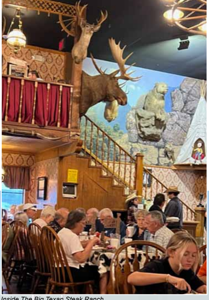
Inside The Big Texan Steak Ranch.

All the cars lined up and drove the 21 miles on Saturday morning to Los Cedros Ranch for our chuck wagon breakfast. We won't talk about the gravel driveway from the road to the breakfast site. Our hosts entertained us with songs and history about the west Texas Indians, their horsemanship and their removal by the Army. If you'd like to learn about this era, read "Empire of the Summer Moon". Chapter 19 specifically tells about the part Palo Duro Canyon played.