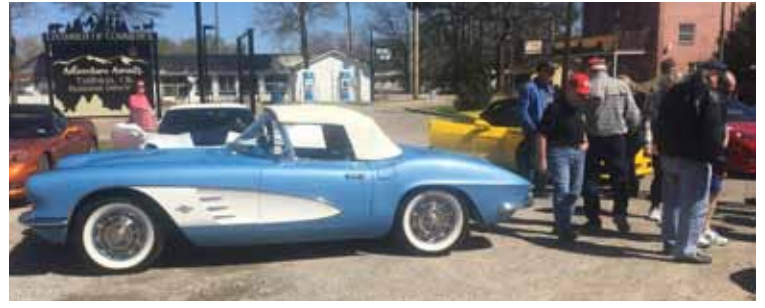
Dennis Conte's Jewel Blue/White 1961 ready to lead the group up the mountain