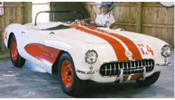
This car was the first 1957 to be equipped with racing brakes and suspension. It was runner-up to the national champion in the B Production class of the Sports Car Club of America.

We will also see many Duntov Corvettes, a Heavy Duty Brake 58, a