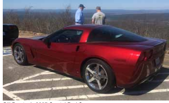
Bill Preston's 2007 Crystal Red Coupe