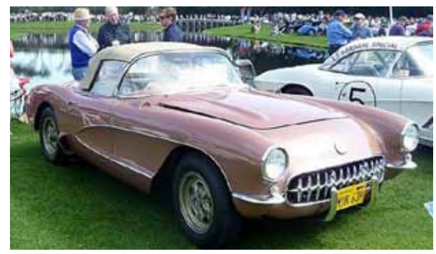
This is one of two existing 1956 SR-1 Corvettes. It was built with racing components to satisfy production requirements for the 12 Hours of Sebring.