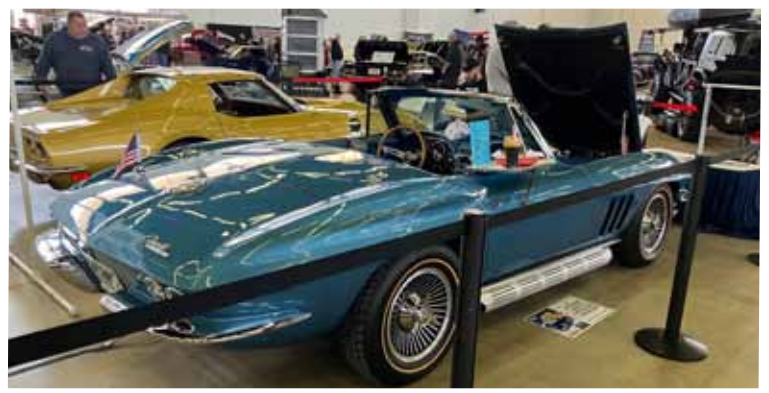
Jeff Clevenger's 1965 Blue Convertible.