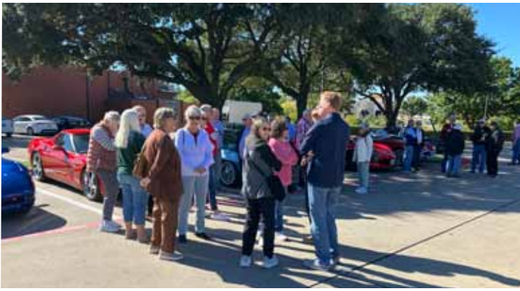
A beautiful November day to gather in the parking lot, visit, and enjoy the great Corvettes before the meeting.