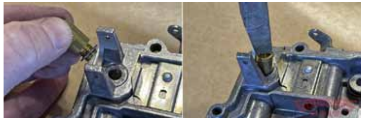
Moving to the top (air horn), we installed the new brass seats (with supplied washers) for the needle-and-seat assemblies, plus a new gasket to seal the air horn to the main body.