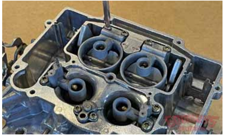
New gaskets from the rebuild kit were also used on the four venturi assemblies as they were screwed back in place.