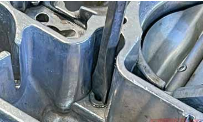
While we did not replace the jets, we did remove, clean, and inspect them.