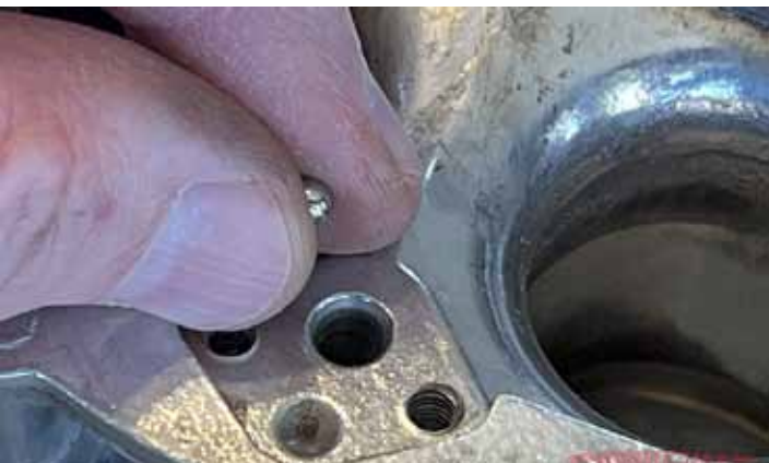
A new pump discharge ball, weight, and gasket were installed before screwing the cleaned pump jet housing back into place.