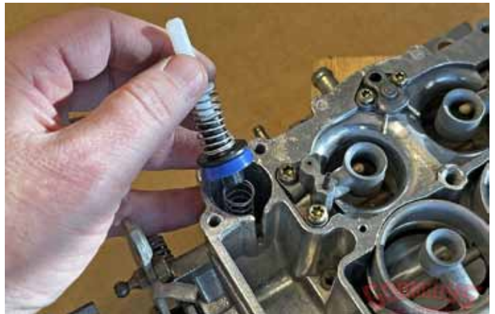
The rebuild kit came with a new accelerator pump spring and plunger, but we ended up buying a new accelerator pump assembly, which is readily available.