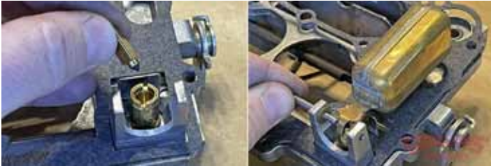
The new needle is then dropped into the seats, and the floats were attached using their original pins.