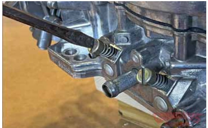
We finished by installing the idle adjusting screws in the base of the body. As a rule of thumb, we started by turning the screws in until they were seated, and then backing them out 1.5-2 turns. We'll make final adjustments once the carb is on the engine and running.

Back issues of "Straight Talk" available on line at: www.VetteLegends.com