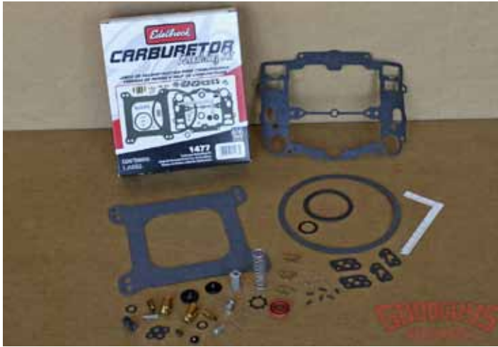
The rebuild kit included fresh gaskets, small wearable parts (needle and seat, pump discharge weight, etc.), and some small fasteners and other commonly replaced hardware.