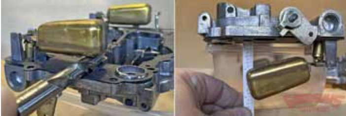
Following the rebuild instructions, we used a 7/16 drill bit to check and set the float level, and the supplied measuring square to check the float drop level. Levels can be adjusted by carefully bending the tab on the float lever.