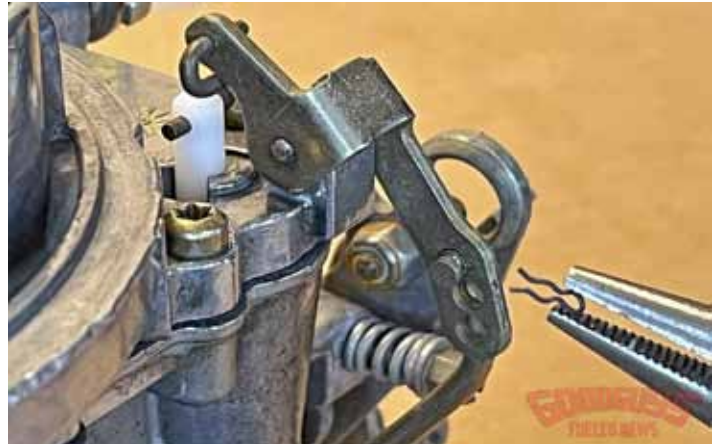
We were thankful to have a few reference photos to consult when re-attaching the various pieces of linkage, like the accelerator pump arm and linkage. It was also helpful to have new clips from the rebuild kit.