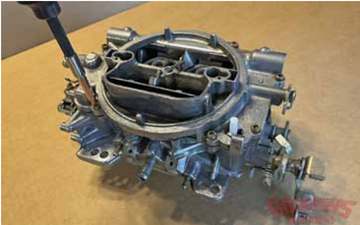
The air horn assembly was then set back in place and secured using the eight attaching screws.