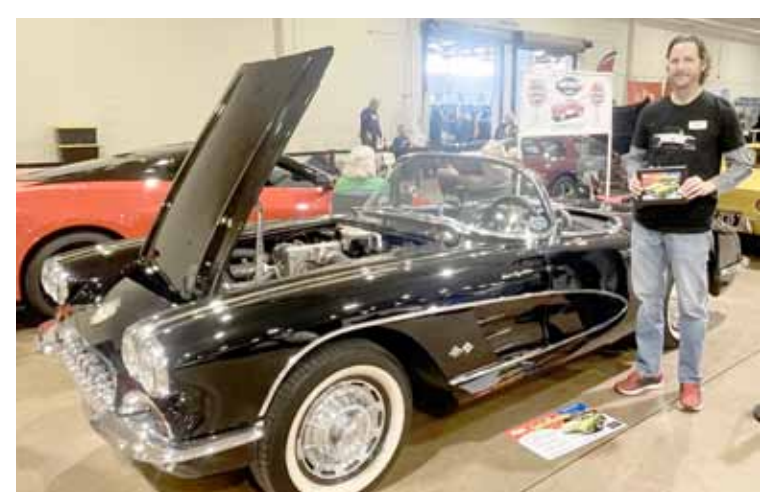
Shane Morris' Black Fuel-Injected 1960 Roadster