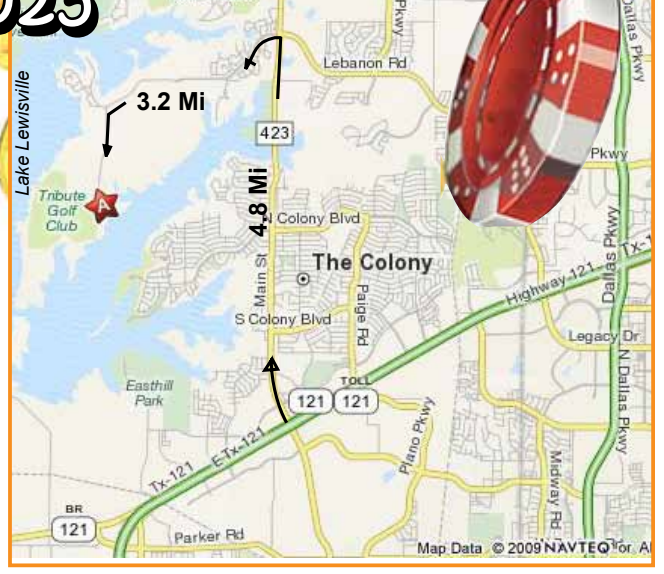
Directions: Exit Hwy. 121 at Main St. (FM 423) in The Colony. Go North 4.8 mi. West on Lebanon Rd. (traffic light) Go West 3.2 mi.to Tribute Golf Club.

When gambling begins after dinner, take that chip to any casino table. There will be five blackjack tables. two craps tables, and one roulette table. The dealer will dispense $2,500 in chips of color in the denominations you request. There are five colors, in denominations of $5, $10, $25, $50, and $100. There will be a sign at each table to remind players and dealers of the color values.